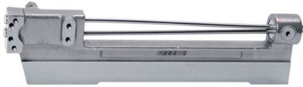
Asieur Part No.: ATA101116 Description: Picanol Main Nozzle