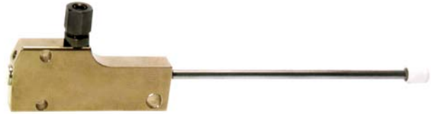
Asieur Part No.: ATA101129 Description: Nozzle