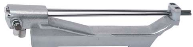
Asieur Part No.: ATA101121 Description: Picanol Main Nozzle