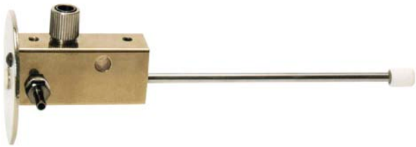
Asieur Part No.: ATA101130 Description: Nozzle